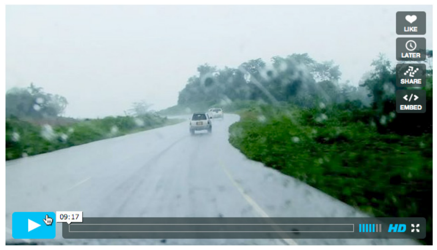
Click image to view project documentary by Newhouse graduate student Chris Giamo.