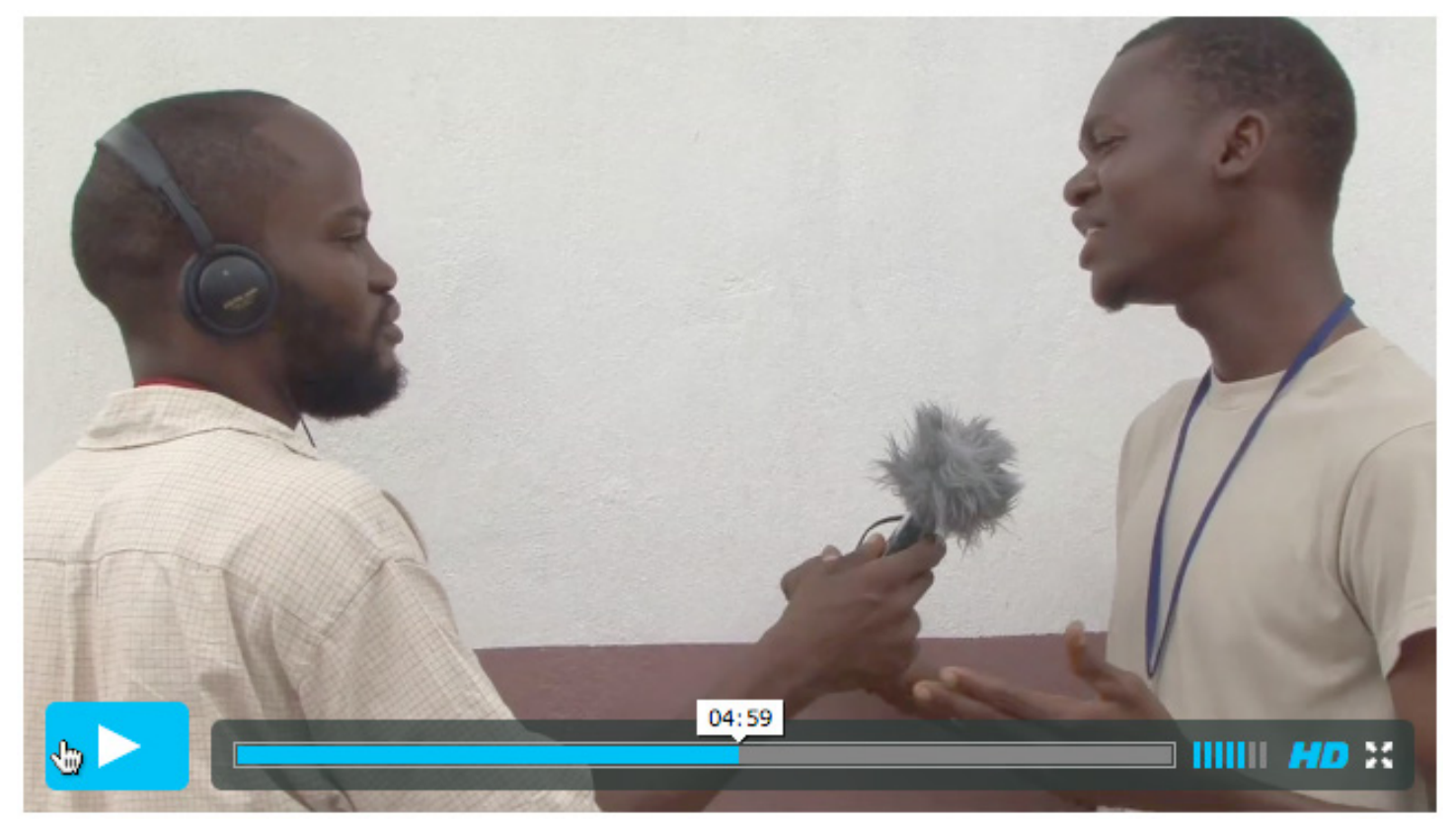
Click image to view the documentary by Newhouse graduate student Chris Giamo