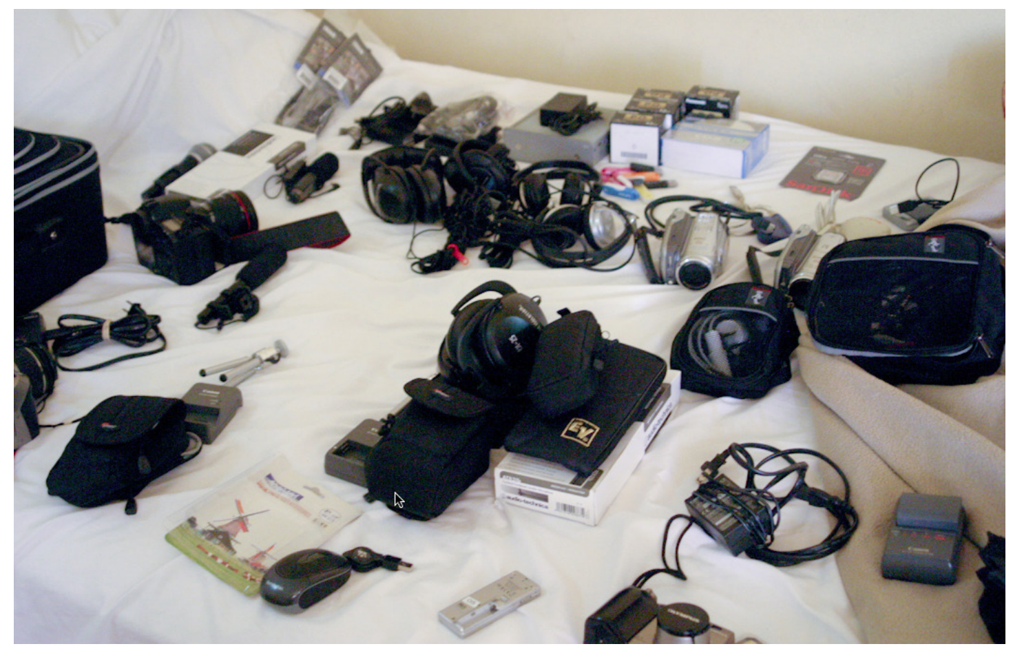
$20,000 in donations from individuals and generous support from the Alexia Foundation and the Newhouse School are now in use.