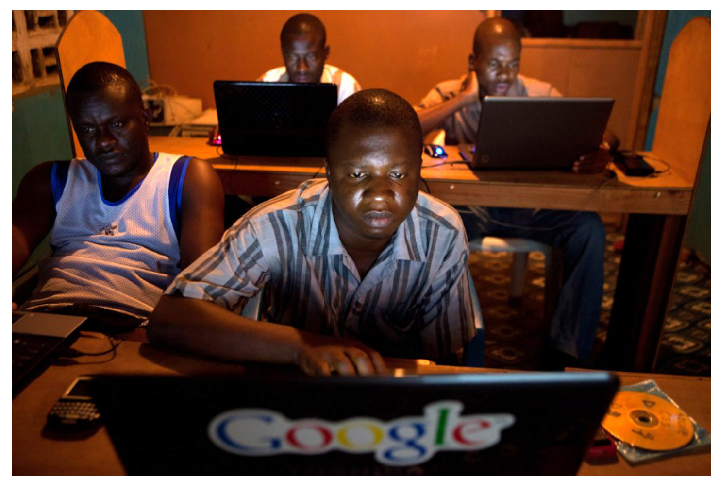
A small group of like-minded web journalists meet each week to share knowledge in a local internet cafe that they co-own.