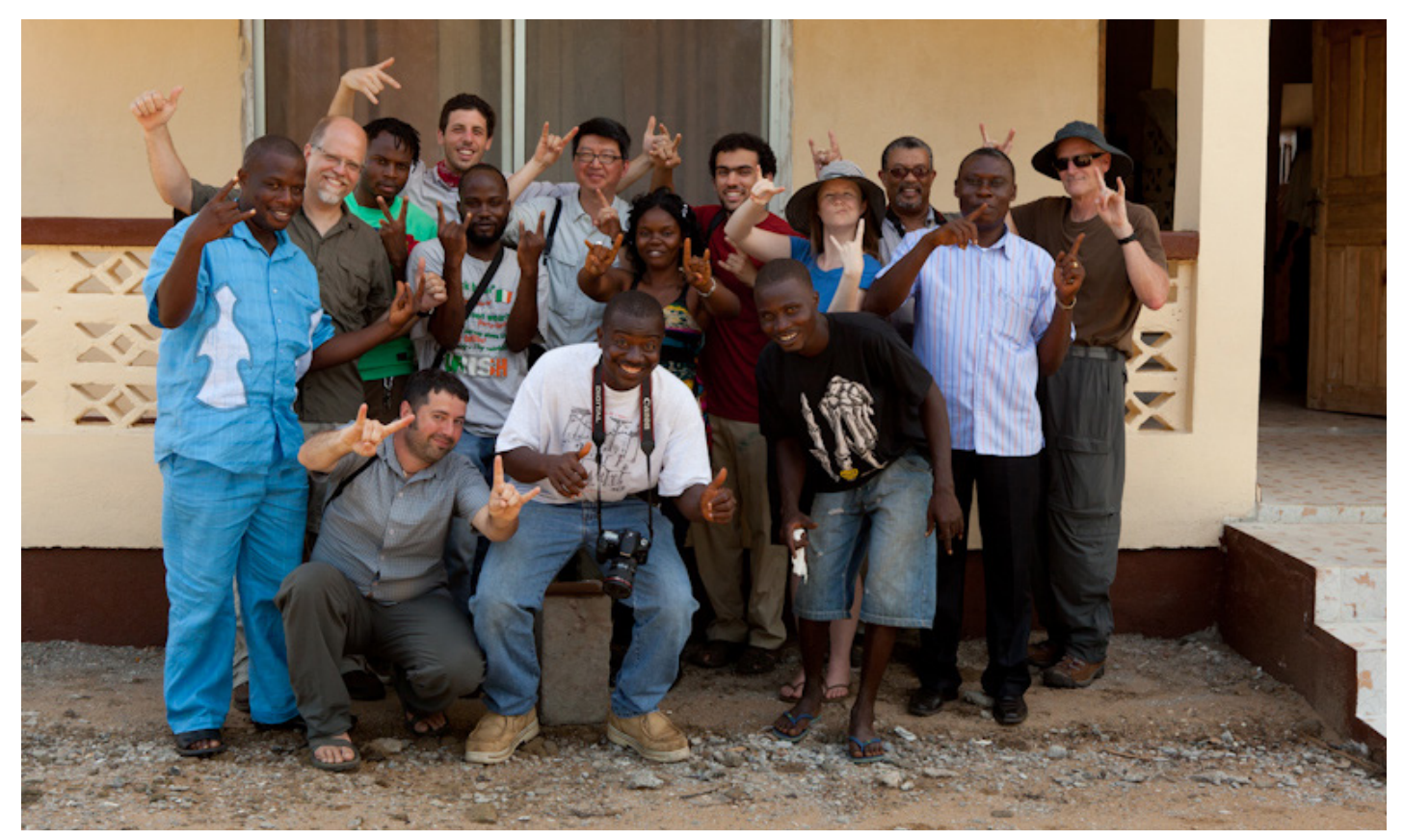
A group photo from the training conducted in rural Rivercess County , Liberia.